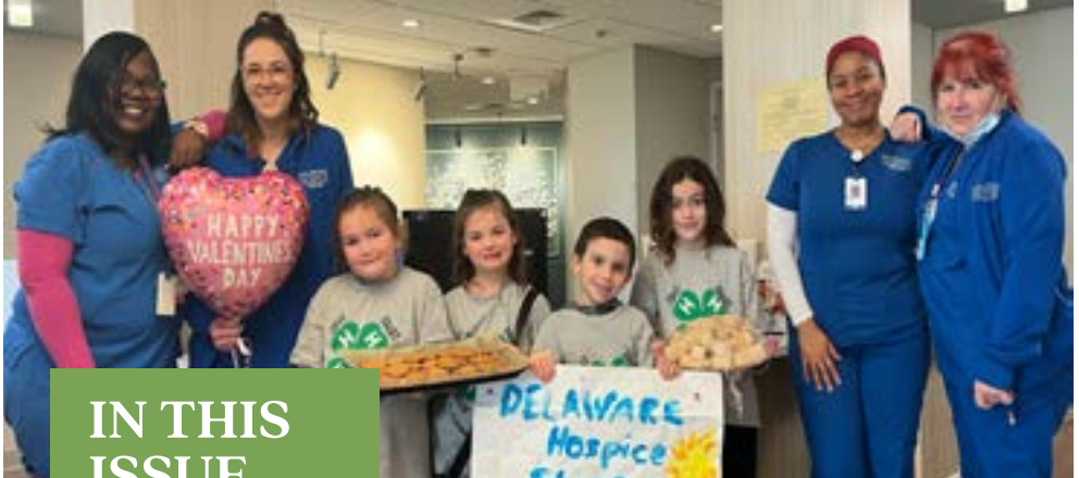
Local 4-H Kindness Matters Club visiting staff at our Saint Francis center.